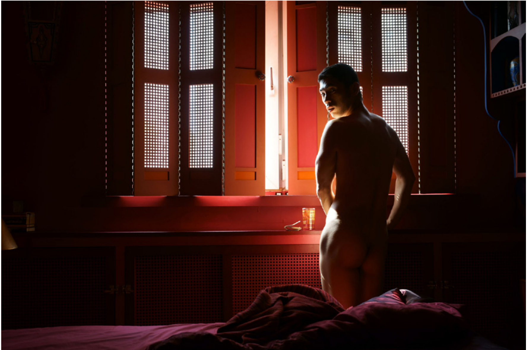
Red Room, 2014.