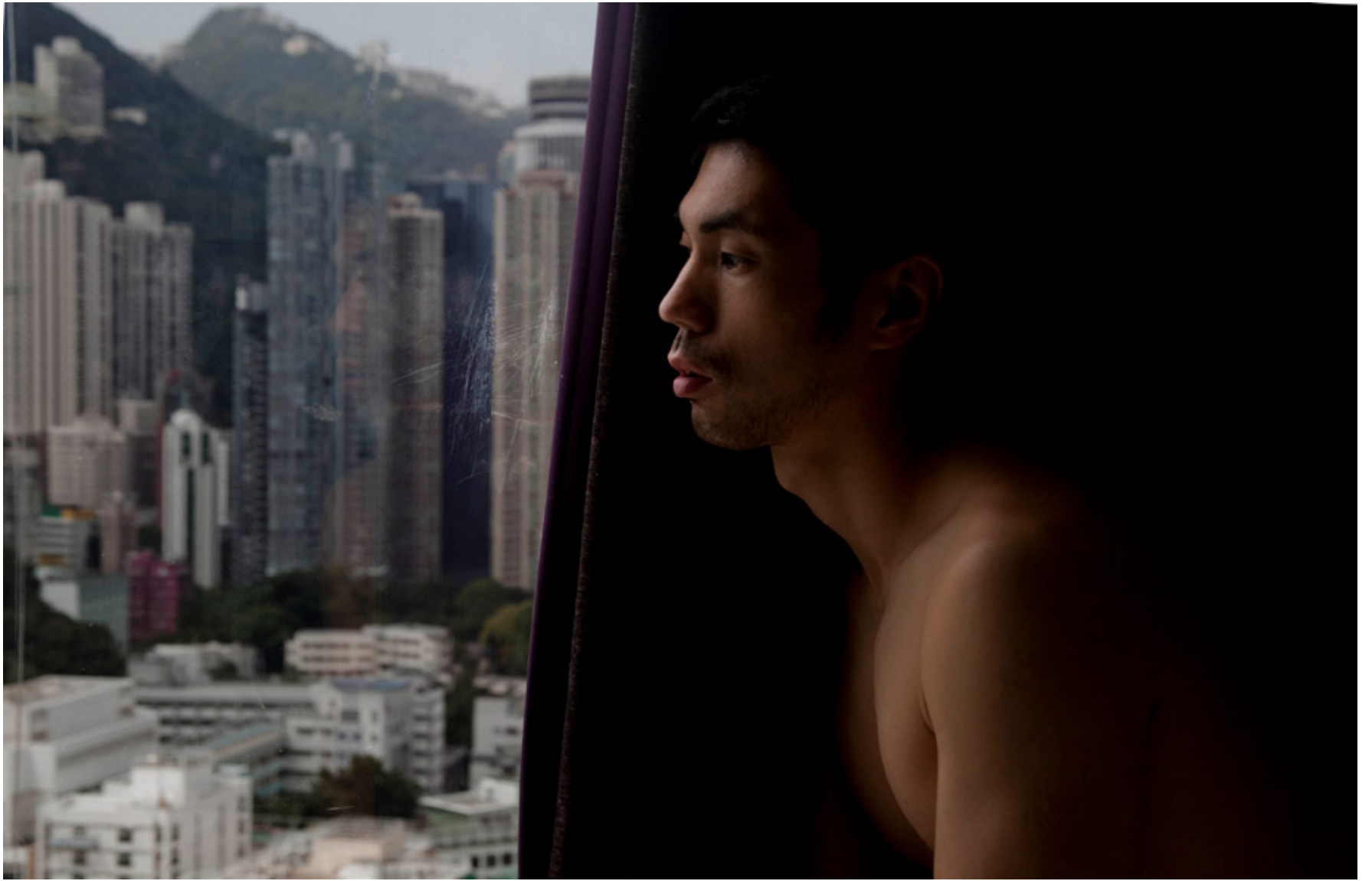
Hong Kong, 2013.