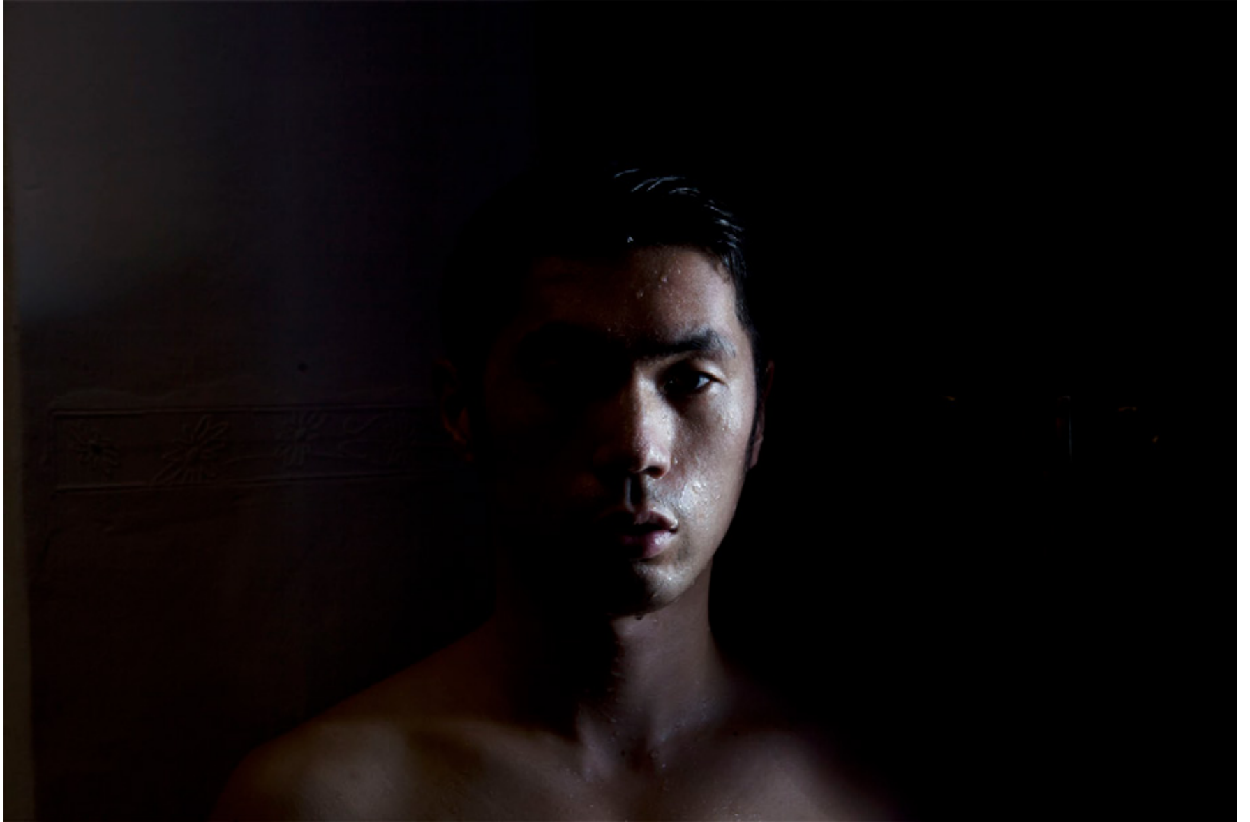
Cusco #2, 2013.