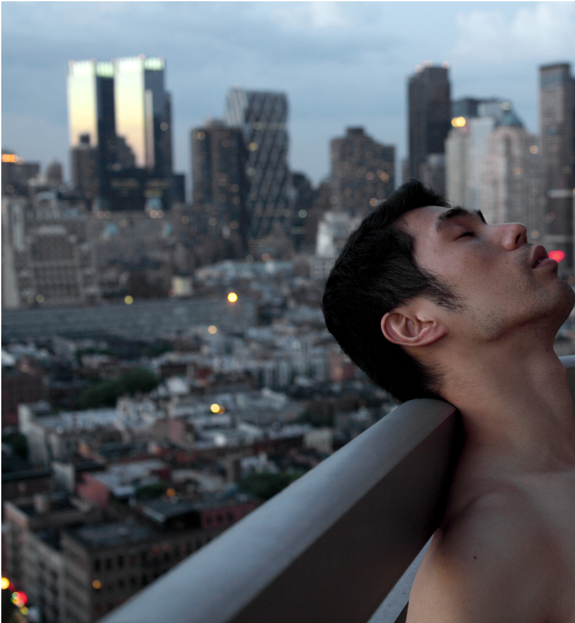
New York, 2010.