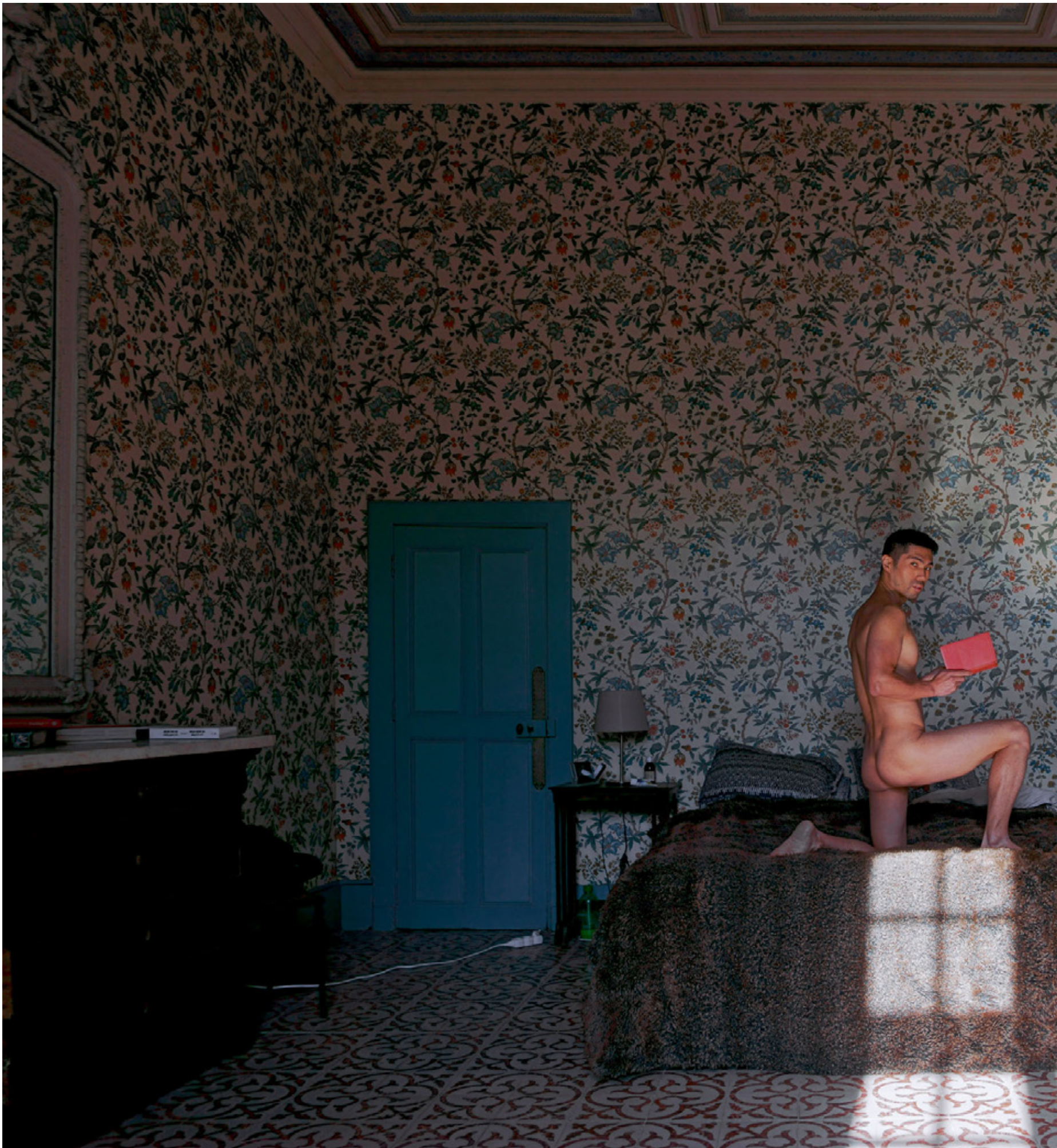
Red Book, 2019.