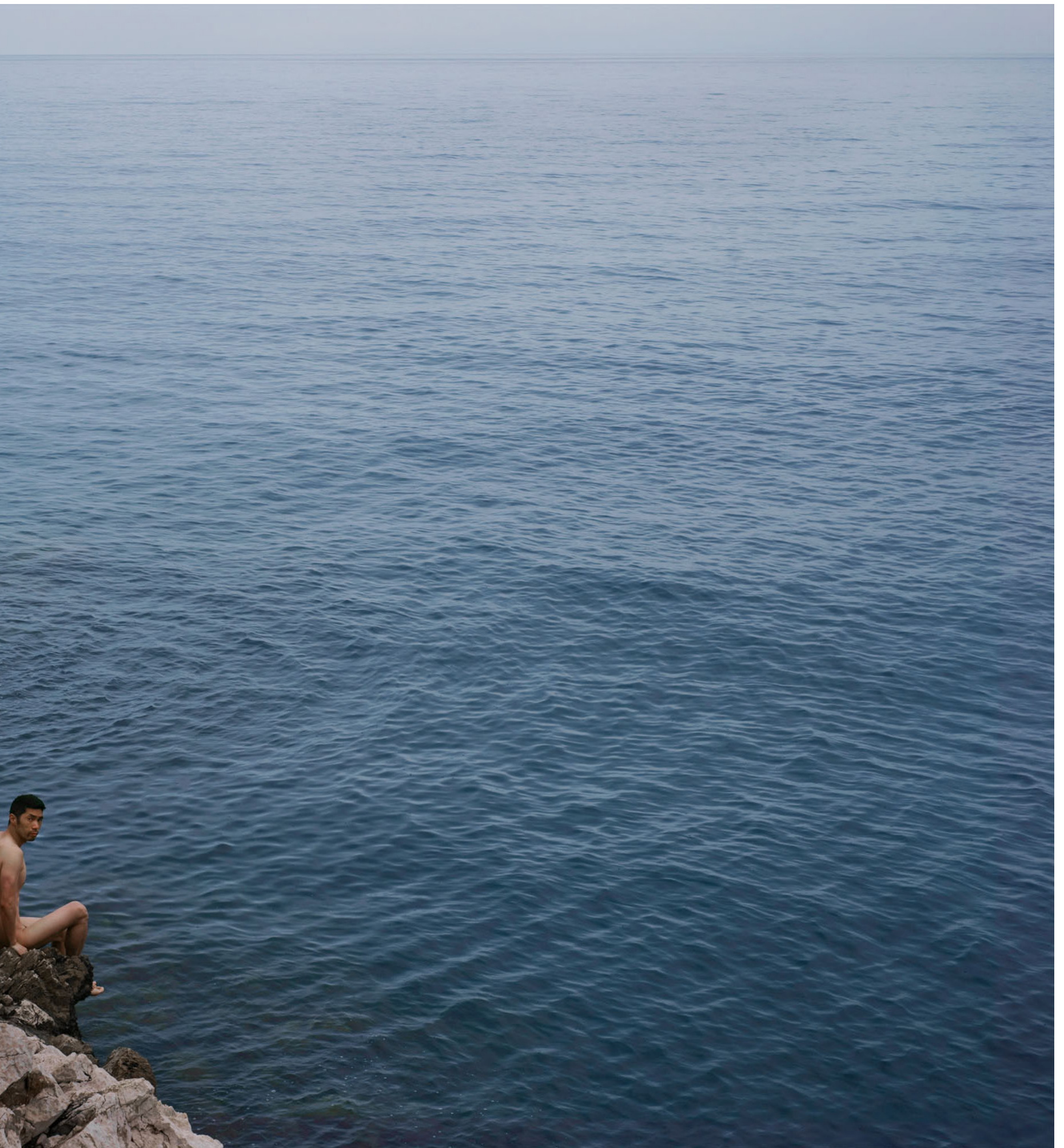
Cote d'azur, 2018.