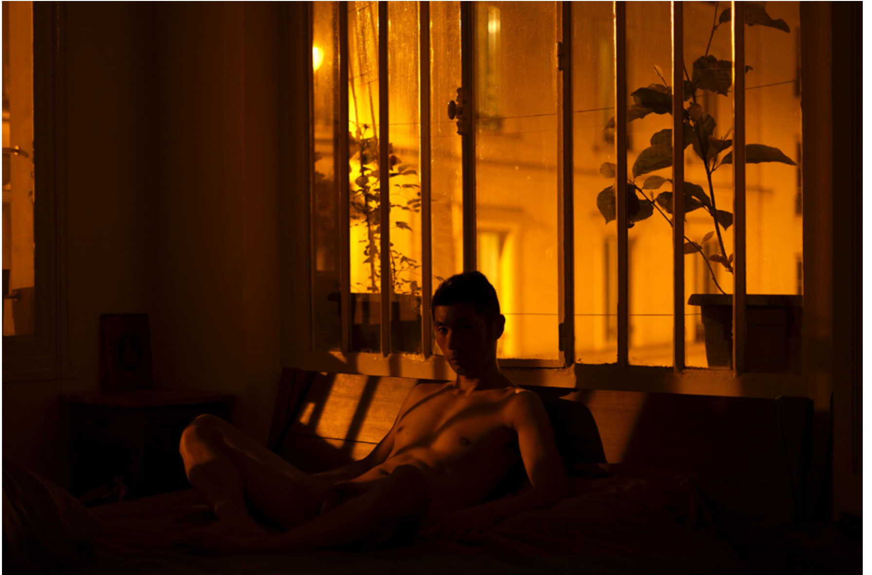
Rue Legouve, 2018.