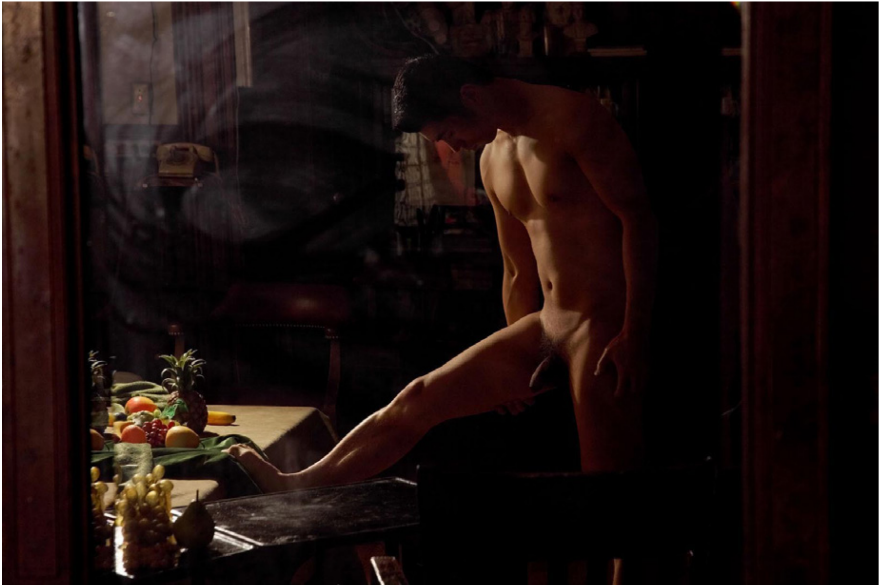
Still Life, 2010.