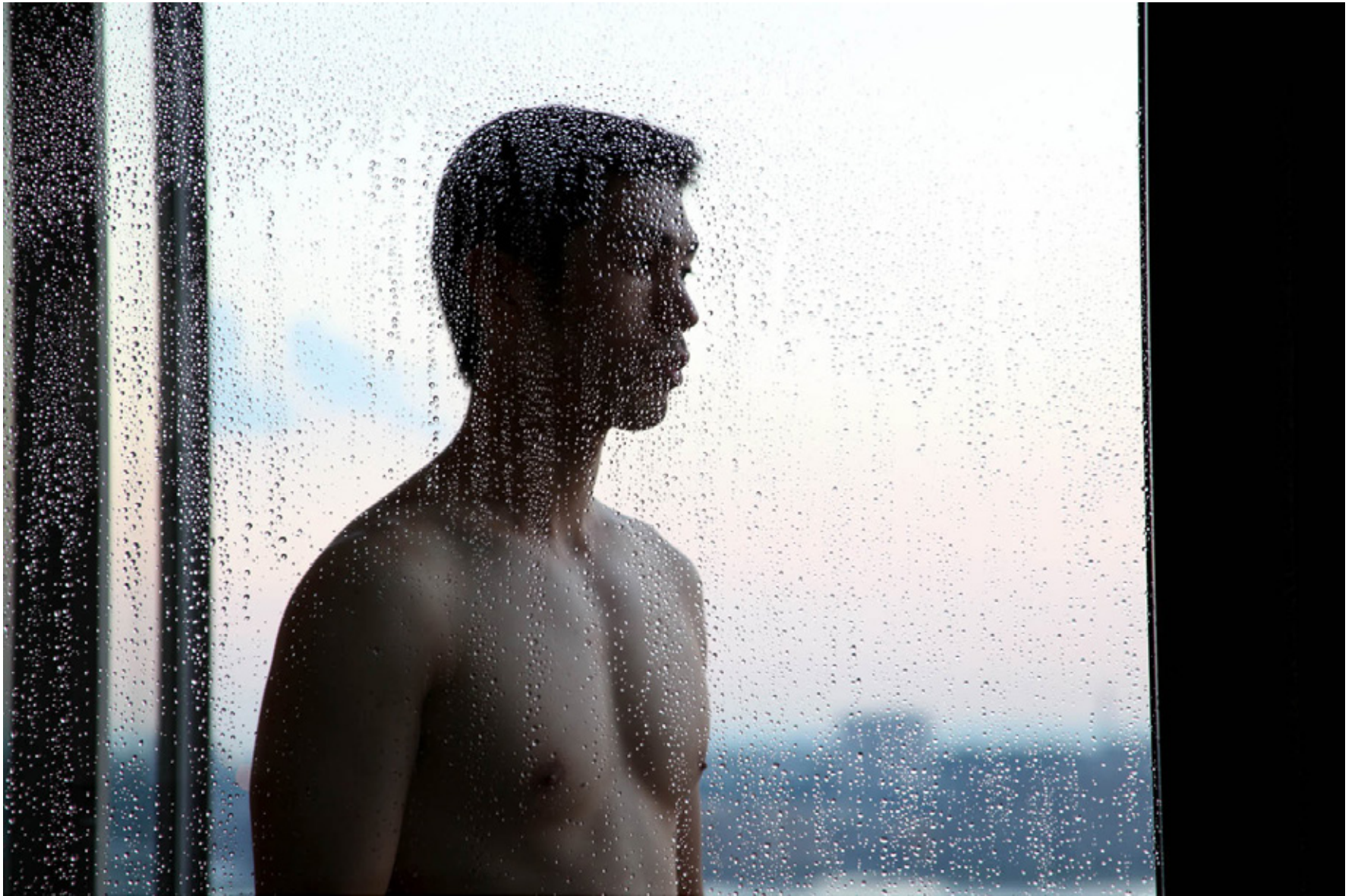
Rain #2, 2010.